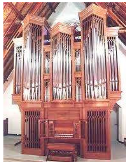
St Matthew's Pipe Organ